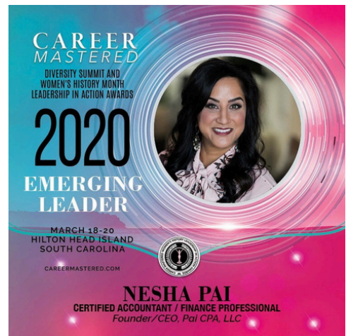
Career Mastered Magazine Emerging Leader Award - 2020